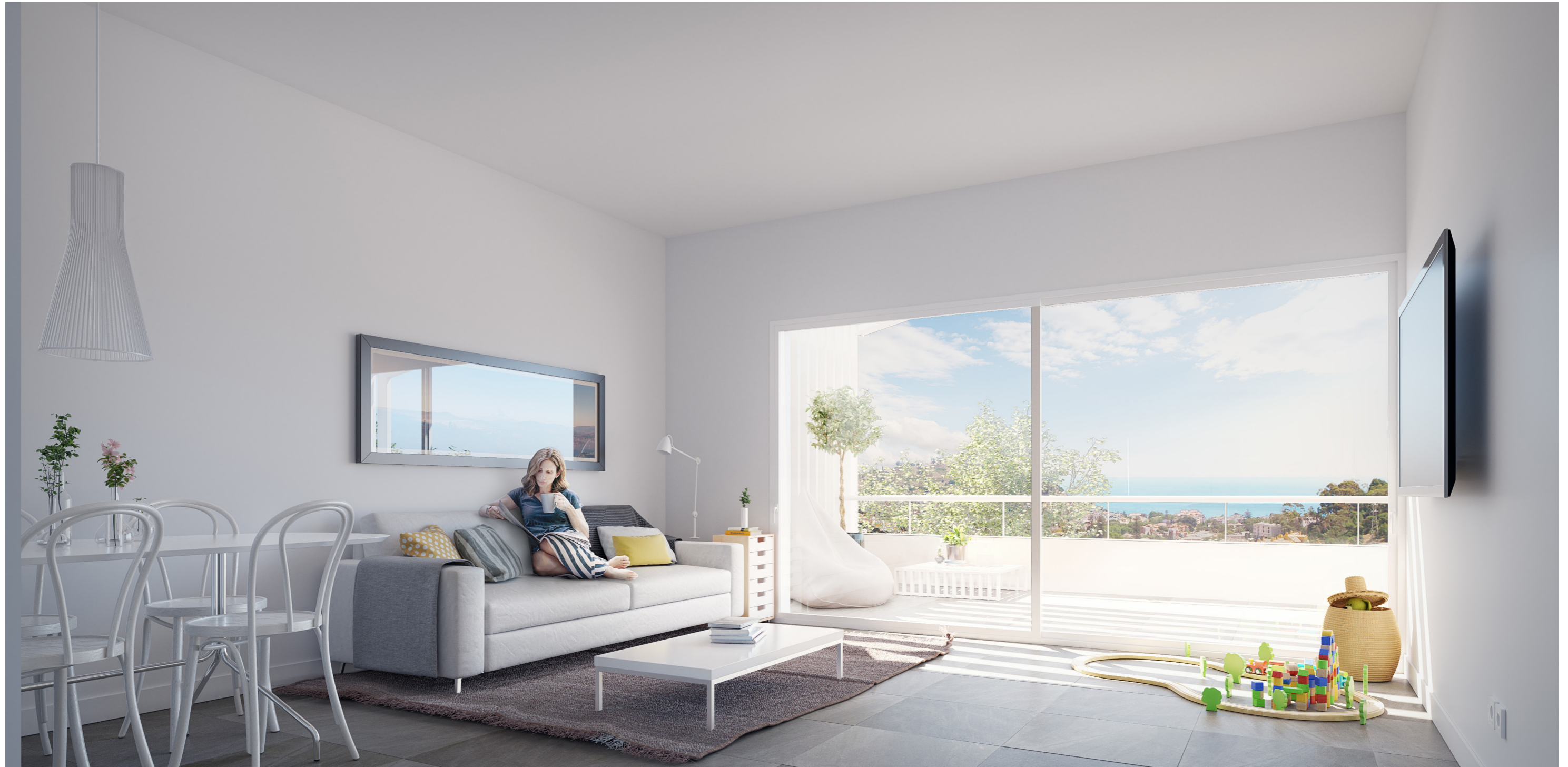
Living room with direct access to the terrace.