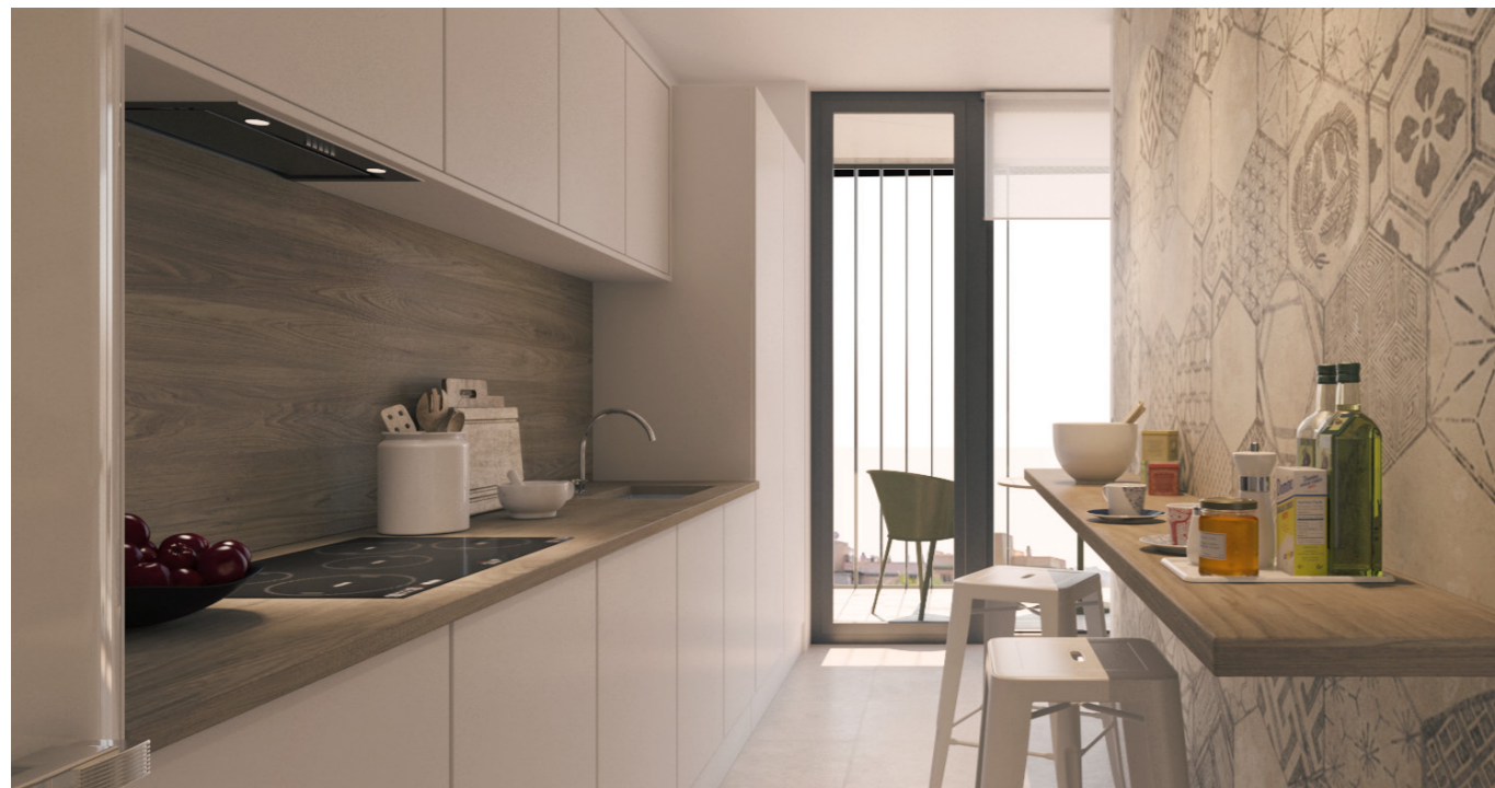
Kitchen and living room “open concept” that achieve perfect communication and versatility between spaces.