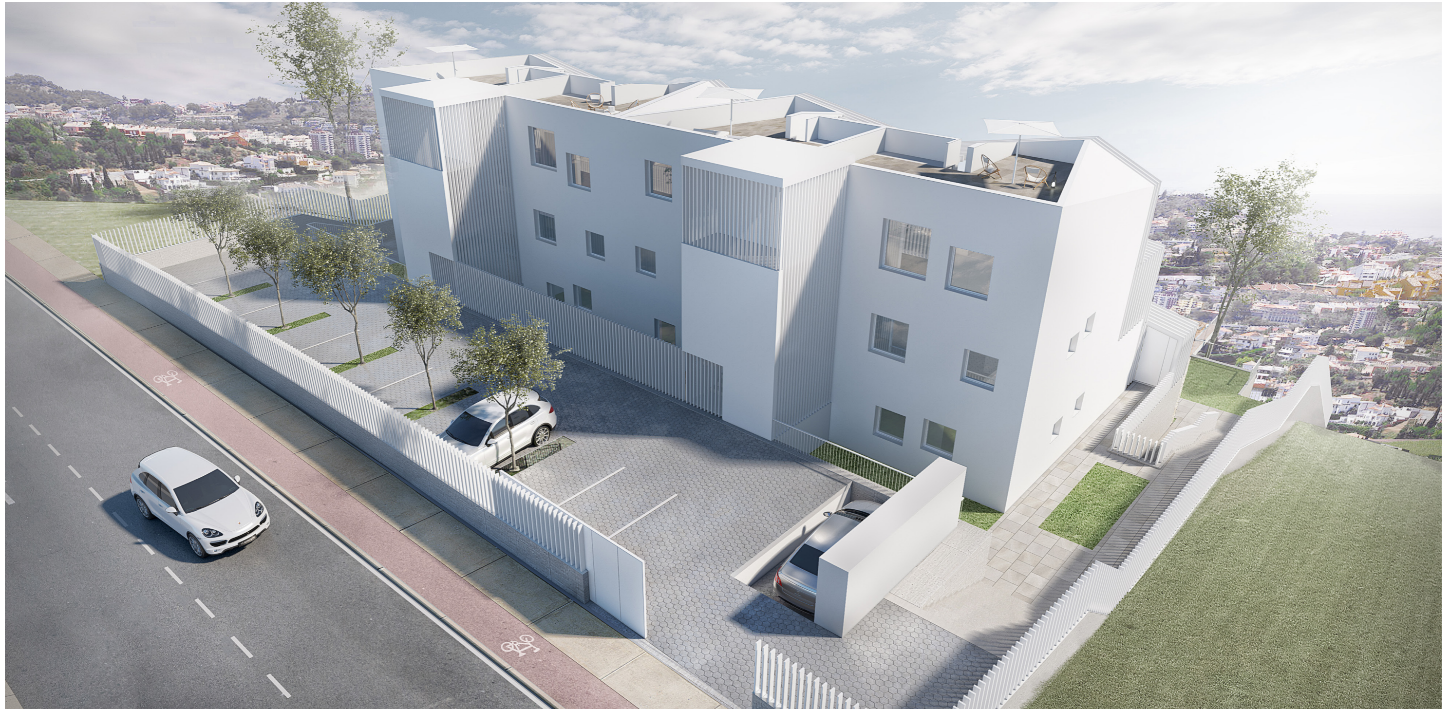
Private residential with modern design.