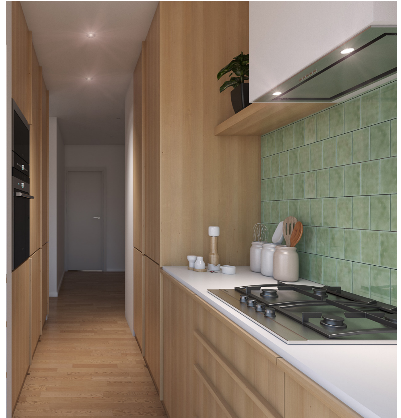
Different kitchens for different people.